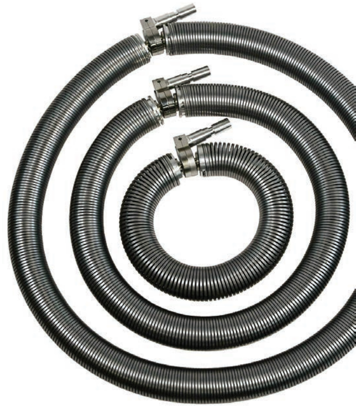
Rolling Spring Electrodes