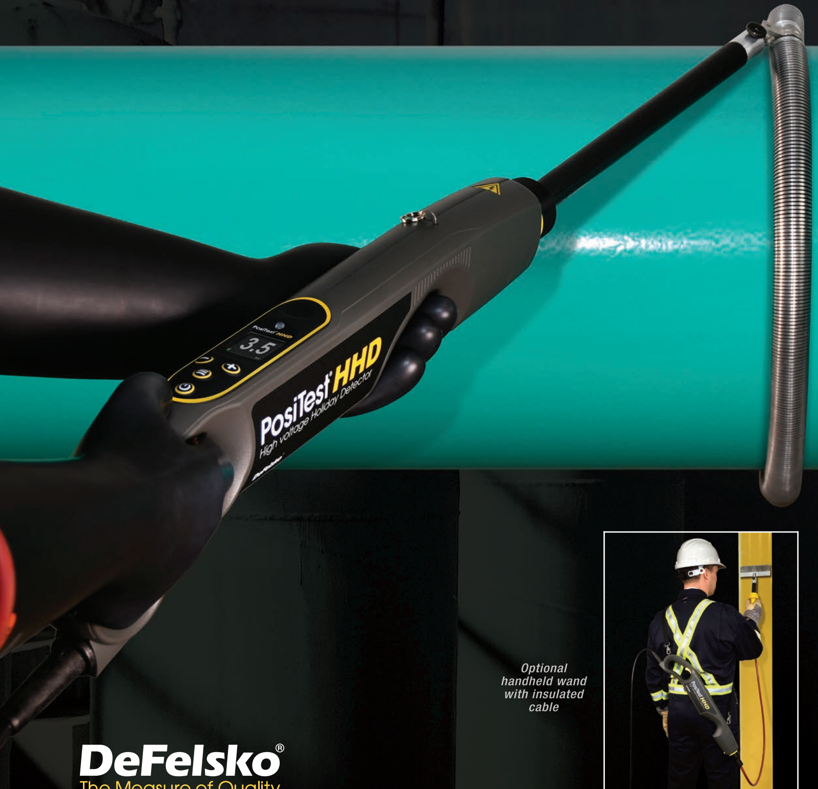
Optional handheld wand with insulated cable

Detects holidays, pinholes, and other discontinuities using pulse DC