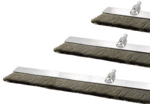
Flat Wire Brush Electrodes

Use spring and brush electrodes made by other manufacturers with DeFelsko adaptors.