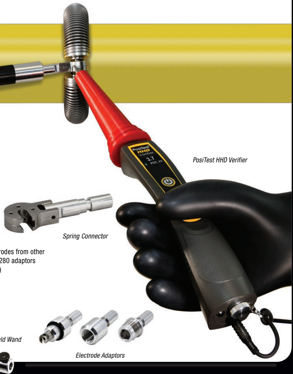
PosiTest HHD Verifier

Electrode Adaptors connect to spring and brush electrodes from other manufacturers—choose between PCWI, T&R, and 266/280 adaptors—not required for SPY electrodes (see table on page 3)