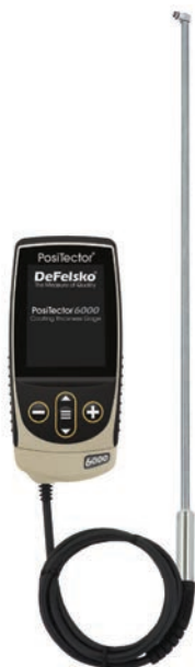
PosiTector 6000 F90ES3