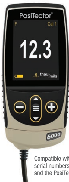
PosiTector 6000 FNGS3

Compatible with PosiTector bodies with serial numbers greater than 700,000 and the PosiTector SmartLink.