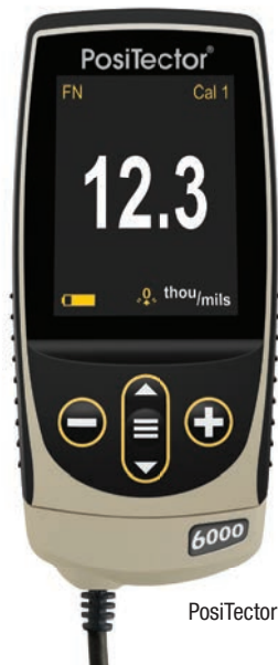
PosiTector 6000 FNTS1