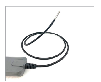
Semi-rigid metal probe provide good pushing strength and can be bent into any desired shape